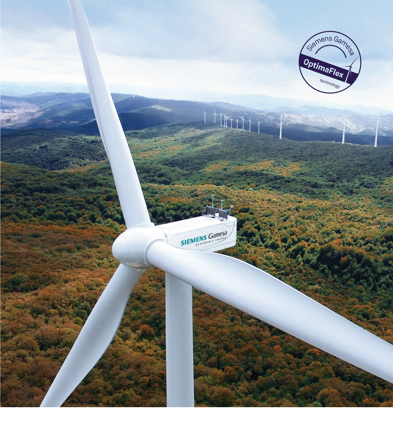
SG 3.4-145 Delivering India's positive energy